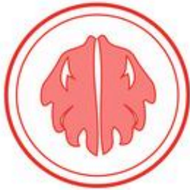
TREE NUTS TRAZAS