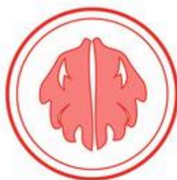
TREE NUTS TRAZAS